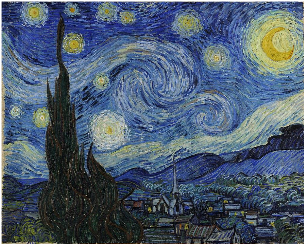
Vincent van Gogh, La Nuit étoilée , 1889, oil on canvas, 28.7 in × 36 1/4 in

" Starry Night " is one of the most famous paintings by Dutch painter Vincent van Gogh. The painting represents what Van Gogh could see and extrapolate from the room he occupied in the asylum of the Saint-Paul-de-Mausole monastery in Saint-Rémy-de-Provence in May 1889. Often touted as one of the artist's masterpieces, the painting has now been housed at the Museum of Modern Art (MoMA) in New York City since 1941.