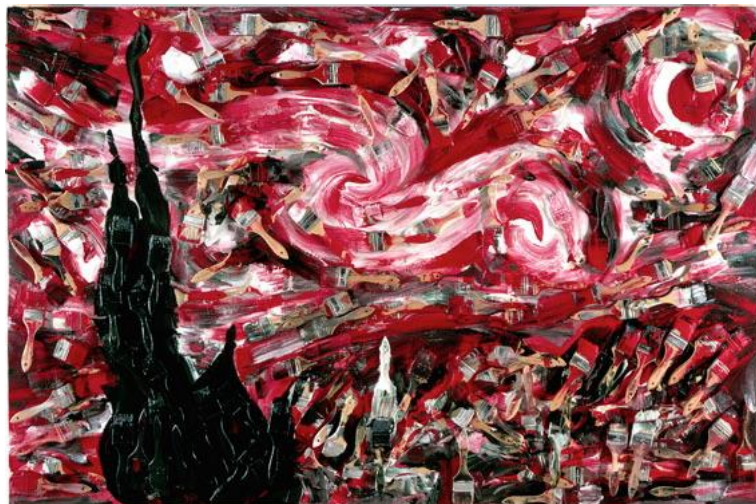
Arman, Après la nuit, l'aube , 1994, accumulation of brushes and acrylic on canvas, 48 x 72 in